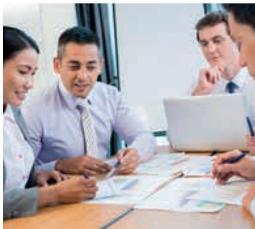
Specialist & Business Courses