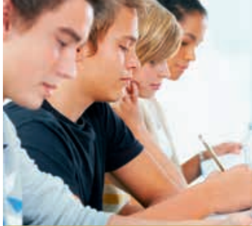
IELTS Test Preparation