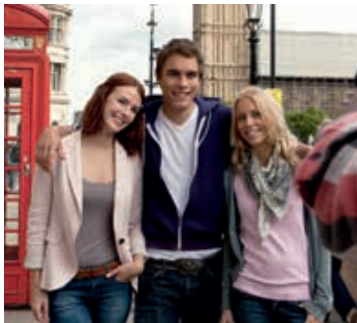
Groups & Mini-Stay