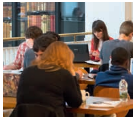
Cambridge Exam Preparation