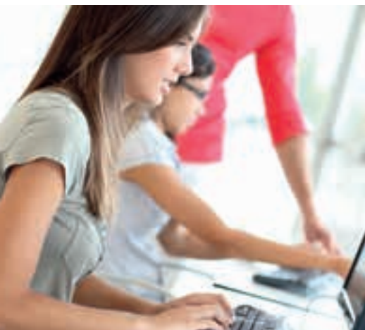
English for Work