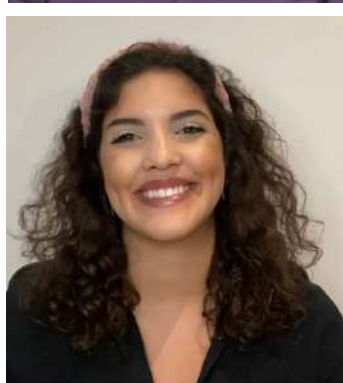
Teacher and Activity Leader