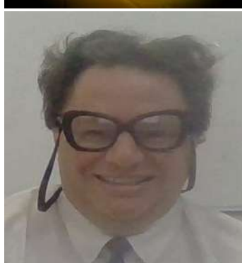
Teacher and Activity Leader