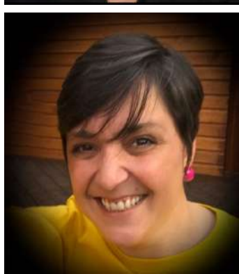
Teacher and Activity Leader