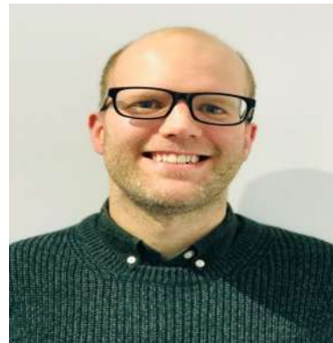
Assistant Director Of Studies