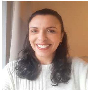
Director of Studies