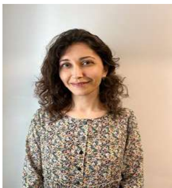
Marketing and Sales Executive