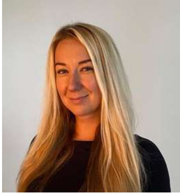
Social Programme Coordinator